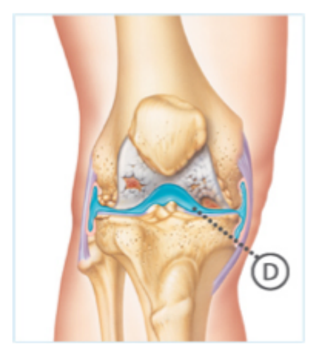
Synvisc-One supplements your knee joint fluid to relieve the pain and improve the knee joint's natural shock absorbing abilities.